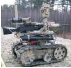
Killer Robots With Automatic Rifles Could Be on the Battlefield in 5 Years http://www.wired.com/2013/10/weaponized-military-robots 10/18/13

Heavy Armor – Tanks were used in Waco to break into the house and inject CS gas. This time robotic tanks could be used to do the same in order to pressure the occupants to surrender.