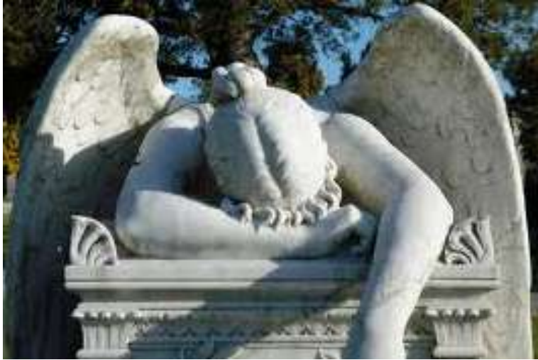
Heaven's Anguish -