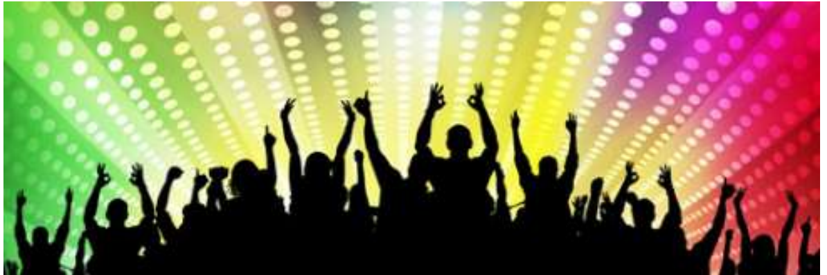
Hell's 3 day party